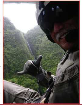
Senator Gabbard got a bird's eye view of O'ahu during a helicopter tour given by the O'ahu Invasive Species Committee on May 10th.

Since session ended on May 2 nd , I've been busy taking tours with staff of the Island Invasive Species Committees (IISC). The IISC are located on each major island and tasked with the control and eradication of invasive species, such as miconia, coqui frogs, pampas grass, little fire ants, etc. I've recently had the opportunity to participate in helicopter tours and hikes on O'ahu, Maui & Moloka'i. I'll also be visiting the Big Island and Kua'i in the coming months. My goal is to use the information gained to work with the appropriate stakeholders to develop ideas for improving our state policies, including funding levels, and public outreach to help us better address the threat invasive species pose to our environment. I'll also be chairing a hearing on this subject and collaborating with ENE members on next steps. These efforts will culminate in the introduction of legislation for the 2014 session.