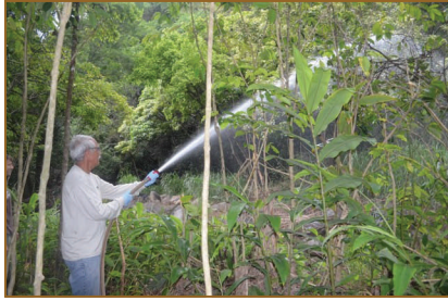
Senator Gabbard sprayed an area of thick foliage on Maui with citric acid to control the spread of coqui frogs on May 20th.