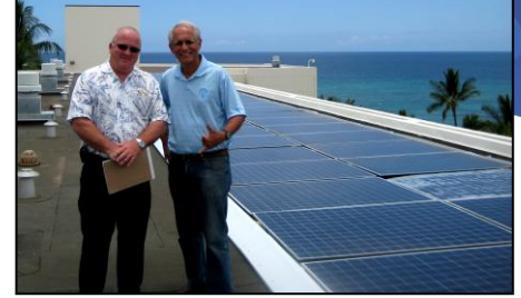
Senator Gabbard checks out the solar panels atop the Mauna Lani Resort on the Big Island on May 21, 2009.