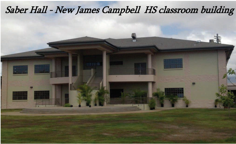
Saber Hall - New James Campbell HS classroom building

Two years ago, I reported to you about the $6 million contract to build a new, air-conditioned 8-classroom building at JCHS. It will host its first students this coming fall.