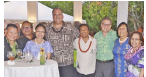
Sen. English among the many dignitaries at the reception of Pacific Islands Conference of Leaders. August 30, 2016.