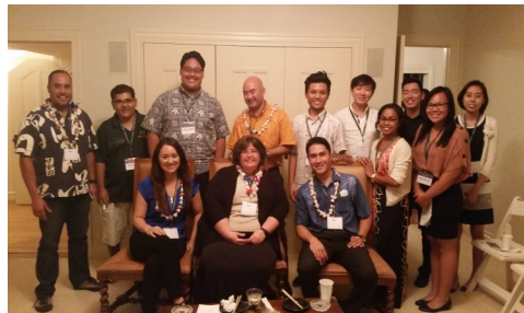
Daniel K. Inouye Leaders in Action: Careers in Public Service Event at University of Hawaii—Manoa.