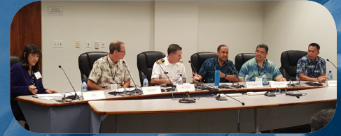
I participated in the Military Affairs Council's Annual Meeting and Partnership Conference to facilitate greater dialogue between our government, private sector, and military leadership to ensure state and federal support for our military communities.