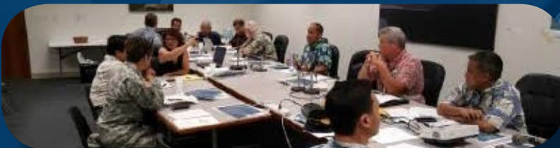
I met with stakeholders to develop a plan for the First Responders Technology Campus and Cybersecurity Data Center in Mililani Technology Park. This facility will consolidate state and city first responders and create jobs in Central O'ahu.