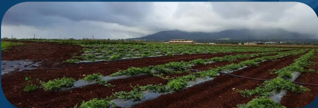
Sugarland Farms, a tenant of the Whitmore Project, has prepped and begun to plant their first crops.