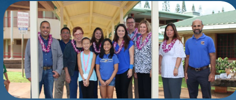
Mililani Mauka Elementary held a ribbon cutting ceremony to celebrate the completion of its newly covered walkway.