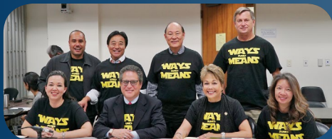
Members of the Senate Ways and Means Committee come together before they begin to deliberate on the state budget.