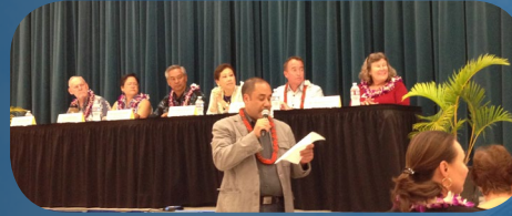
The Mililani Middle School Community Meeting provided a venue to inform the community on the benefits of transitioning to a single-track calendar.