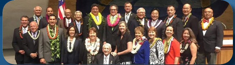
The State Senate adjourns sine die for the 2016 legislative session.