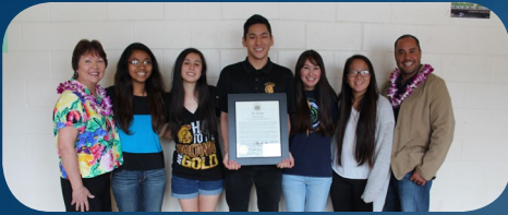
An honorary certificate was presented to the Associated Students of Mililani High School for receiving the National Gold Council of Excellence Award.