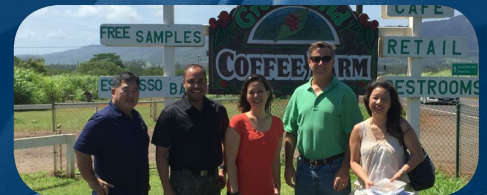
It was important to take my Senate colleagues on the Whitmore Project to learn about ongoing efforts to revitalize agriculture in Central O'ahu.

HEALTH: Earlier this year, Wahiawā General Hospital (WGH) announced that it was in danger of closing its doors and ending all operations if it did not receive emergency financial assistance. Servicing over 20,000 residents and visitors per year, WGH is the largest private job center and the only major medical facility that provides emergency medical services to Central O'ahu and North Shore communities. Recognizing the importance of preserving WGH, the Legislature included $2.5 million in general funds for the hospital to continue operations for the next fiscal year while it develops a sustainable plan for the future. I would like to thank the community for showing their overwhelming support to save Wahiawā General Hospital.