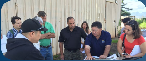
Members of the Senate Committee on Ways and Means learn about ongoing efforts to revitalize agriculture in Central Oahu through the Whitmore Project.