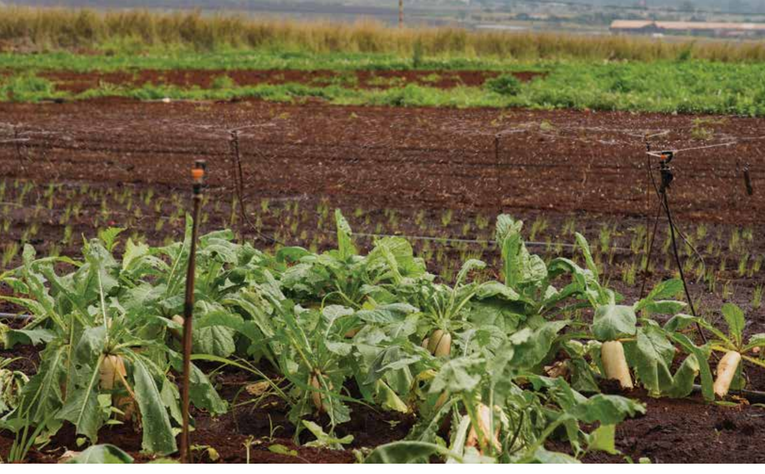
Galbraith Estate lands cleared by Sugarland Farms in exchange for rent credit is once again being farmed.