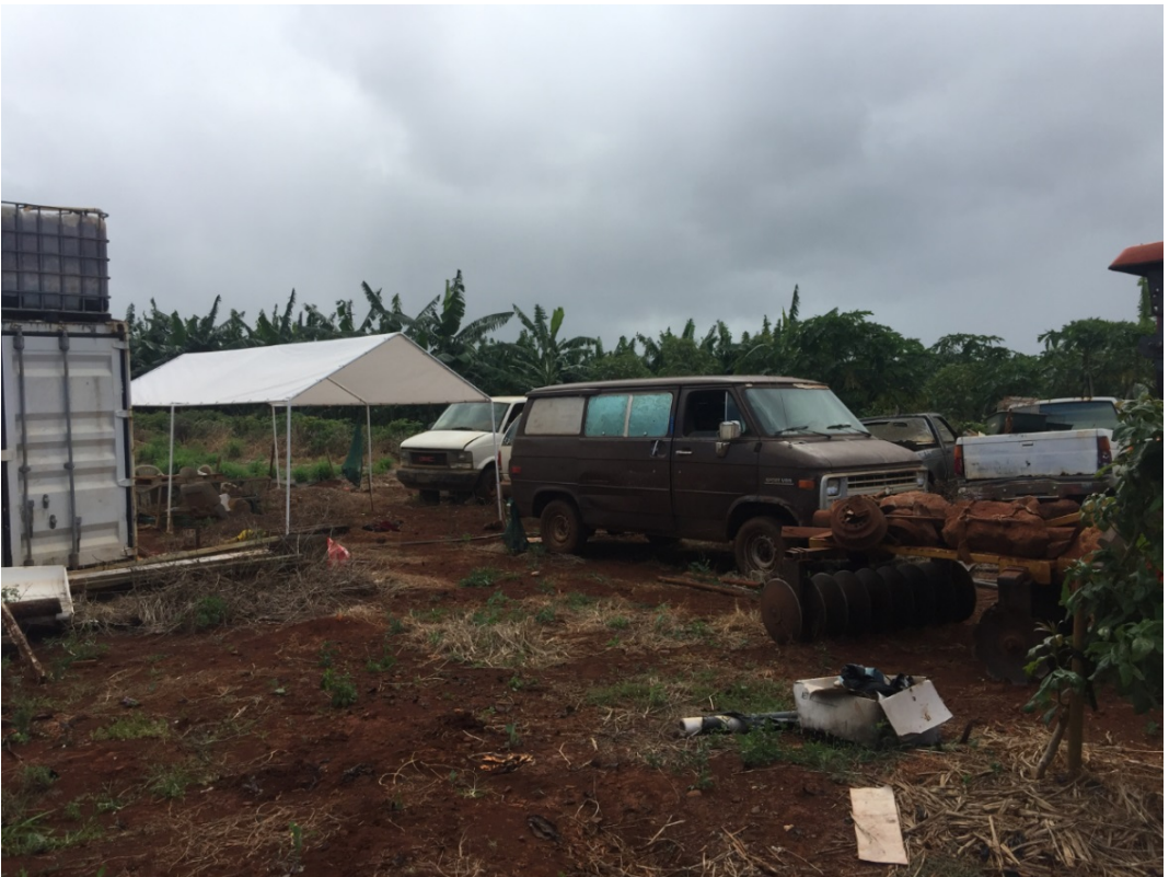
Abandoned vehicles on the small farmer's License area

The ADC has been struggling with getting the small farmers to comply with the terms and conditions of their License agreement. During site inspections at the Galbraith Small Farms, ADC noticed trash, abandoned vehicles, an unpermitted structure, and feral chickens. ADC also received numerous complaints from the security guards about the small farmers leaving security gates open and/or unlocked and remaining on the farm after normal business hours for reasons unknown. Numerous letters were sent the farmer, but little action has been taken by the farmer to comply with the License. The last letter was sent on September 27, 2018 requesting corrective actions. The ADC is giving the farmers one week to take corrective actions. If the corrective actions are not taken by October 8, 2018, the ADC may make a request to rescind the Land License. Furthermore, the ADC has made three separate attempts to contact some of the farmers who received ADC Board approval to farm the GAL and have not heard back from them. There are no set conditions that put a timeframe on how long t. Below are some photos of the small farmers License area: