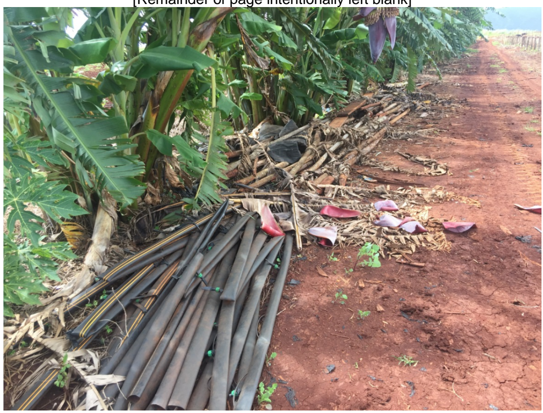
[Remainder of page intentionally left blank]