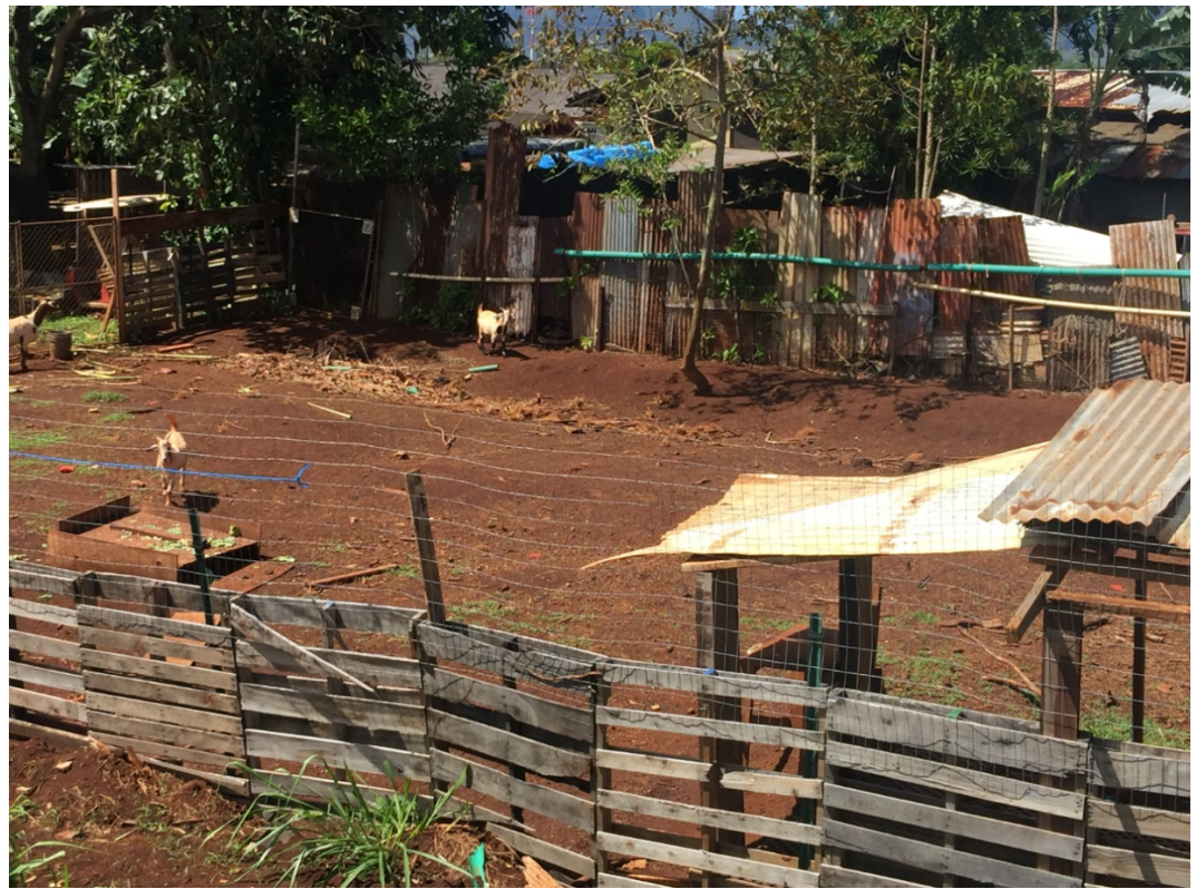
Goat pen within drainage easment on State property