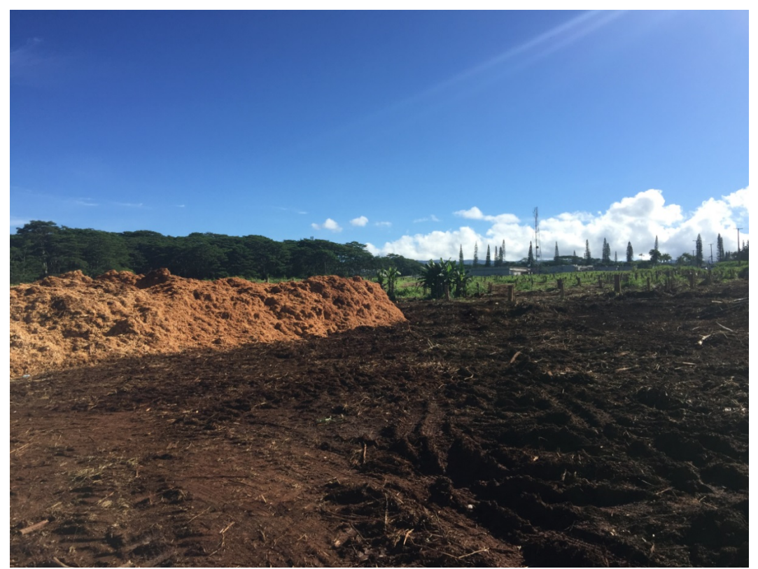
After - 20 acres of Albizia trees were cut down on September 26, 2018