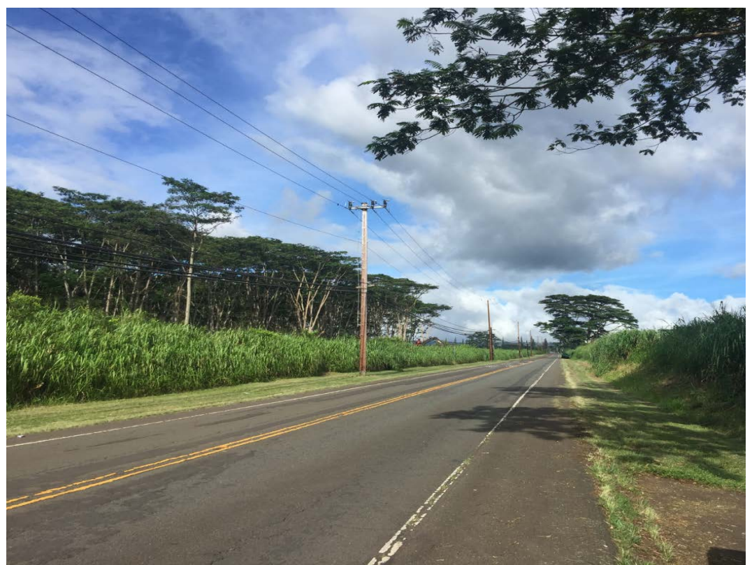
After – Albizia trees cut down September 28, 2018