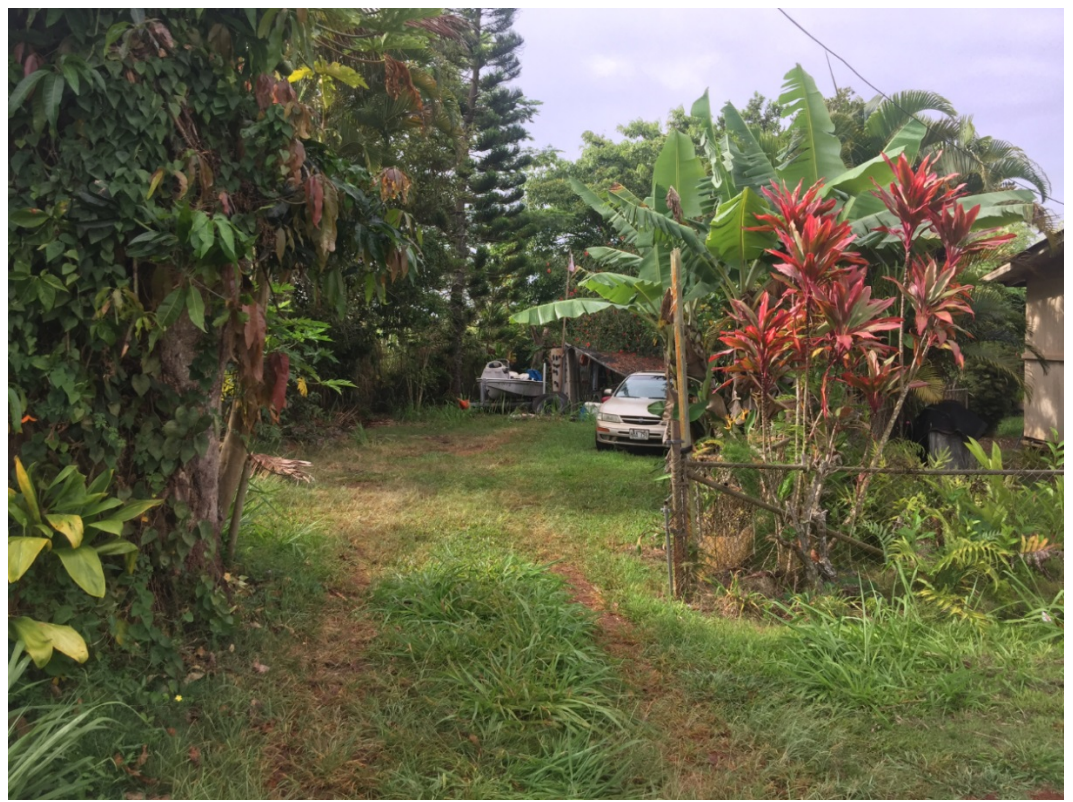
Fence indicates where resident's property ends