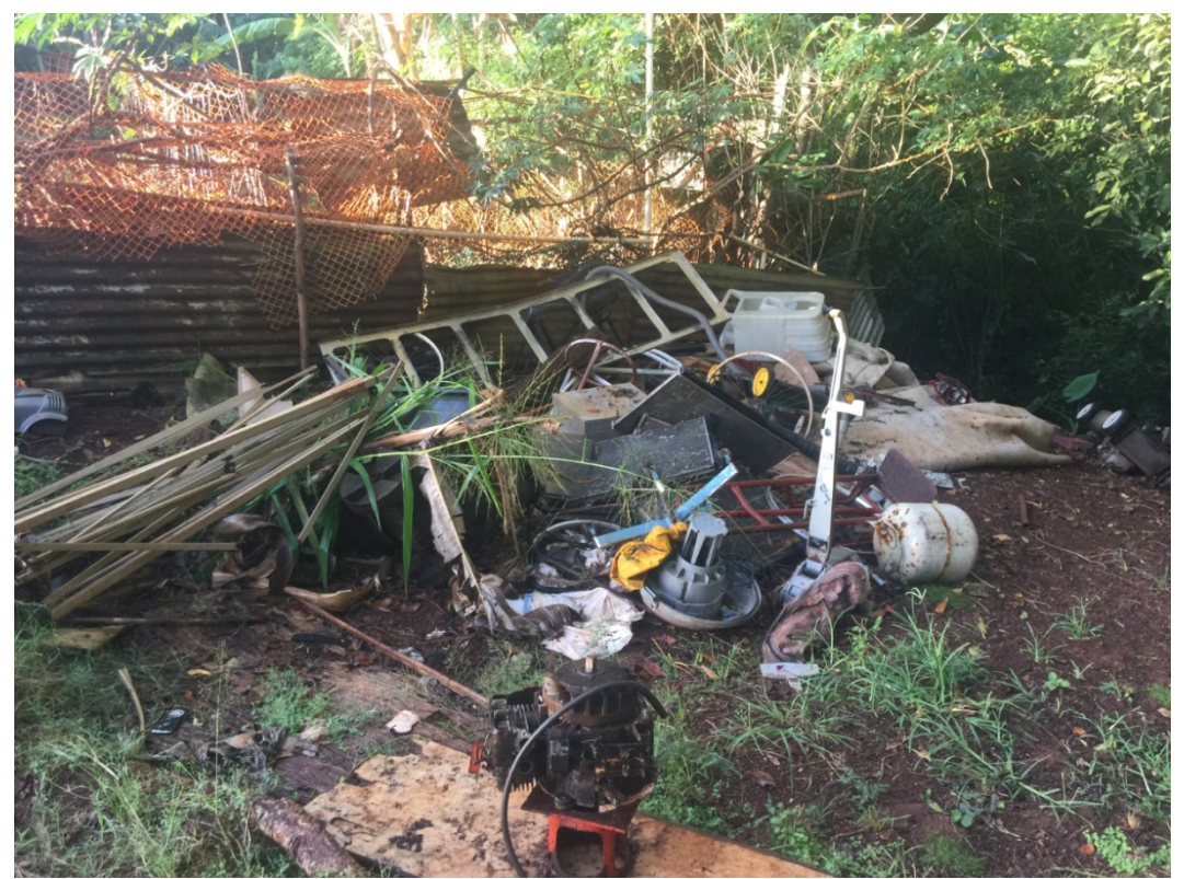
Household trash dumped on ADC property along Uwalu Circle