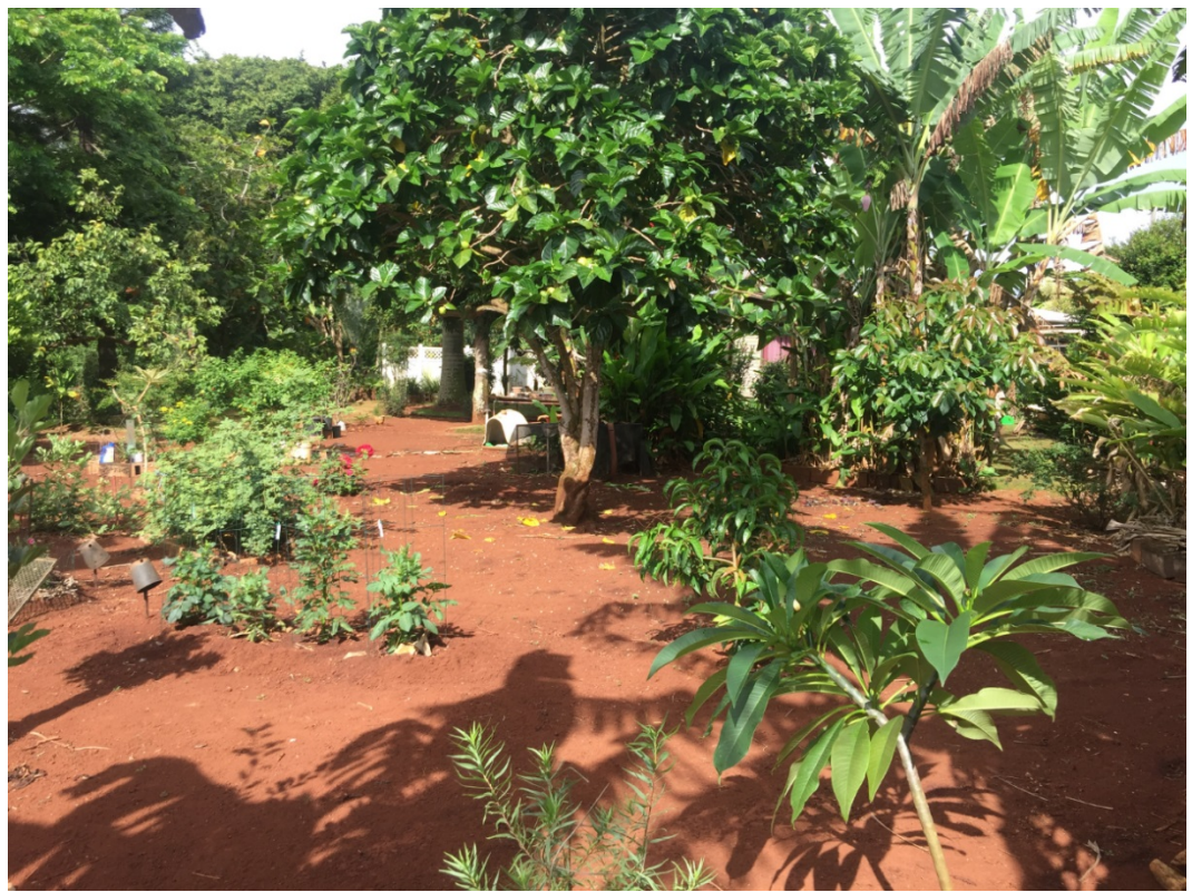
Garden in drainage easement on State property