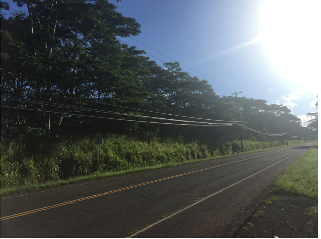
Before – Albizia overhanging powerlines along Whitmore Ave.