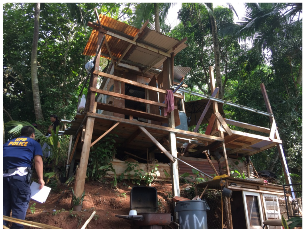
Illegal structure built on ADC property in natural forested area along Uwalu Circle