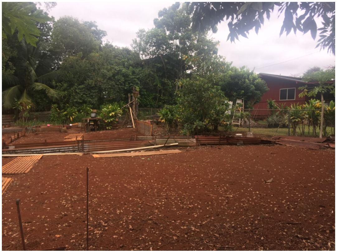
Garden in drainage easement on State property