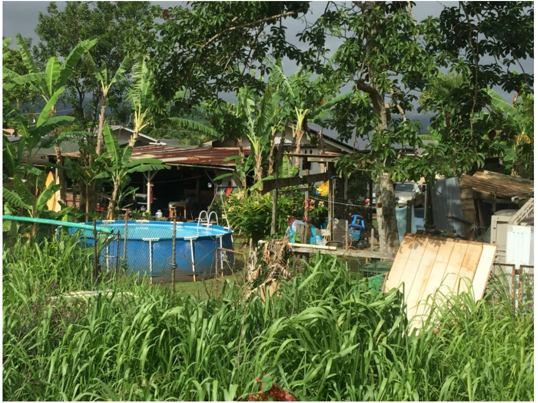
Swimming pool and unpermitted structures on State property