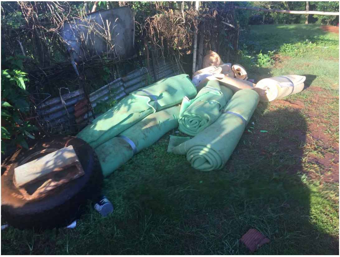
Flooring material dumped on ADC property along Uwalu Circle