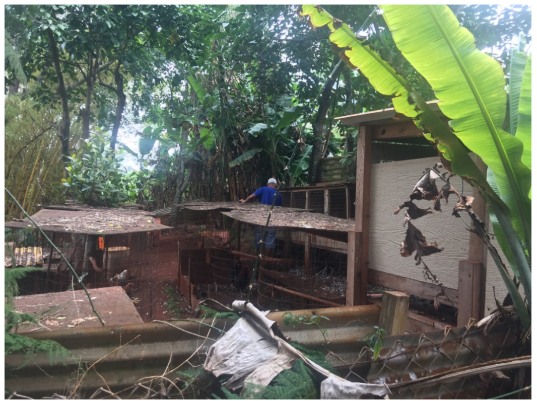
Fighting chicken farm in natural forested area on State property