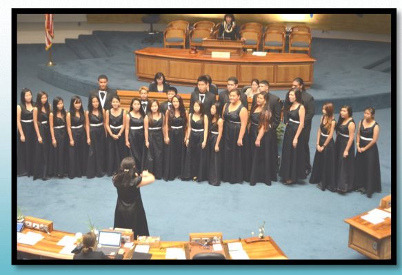
McKinley High School Choir provide a moment of Contemplation before the Hawaii State Senate (April 29, 2014)