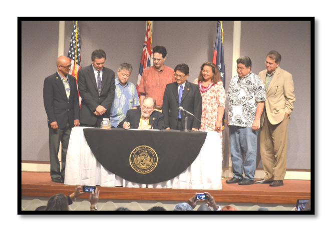
Top: Governor Abercrombie signs SB2609, Relating to Minimum Wage into law as Act 82 (May 23, 2014)

Session (January-May): Monday-Friday, 8am-7pm Interim (May-December): Monday-Friday, 9am-5pm