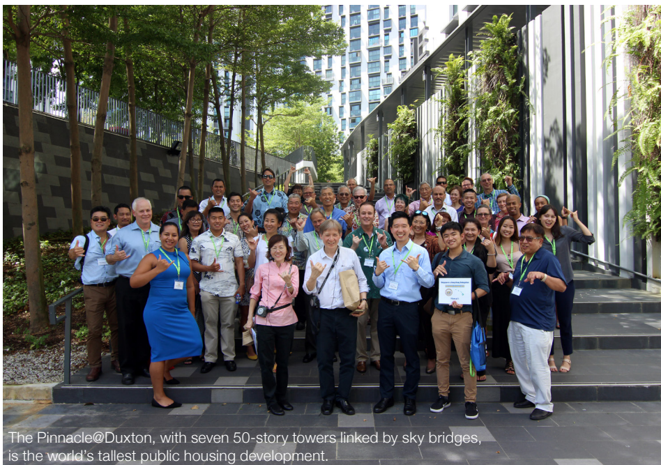
The Pinnacle@Duxton, with seven 50-story towers linked by sky bridges, is the world's tallest public housing development.