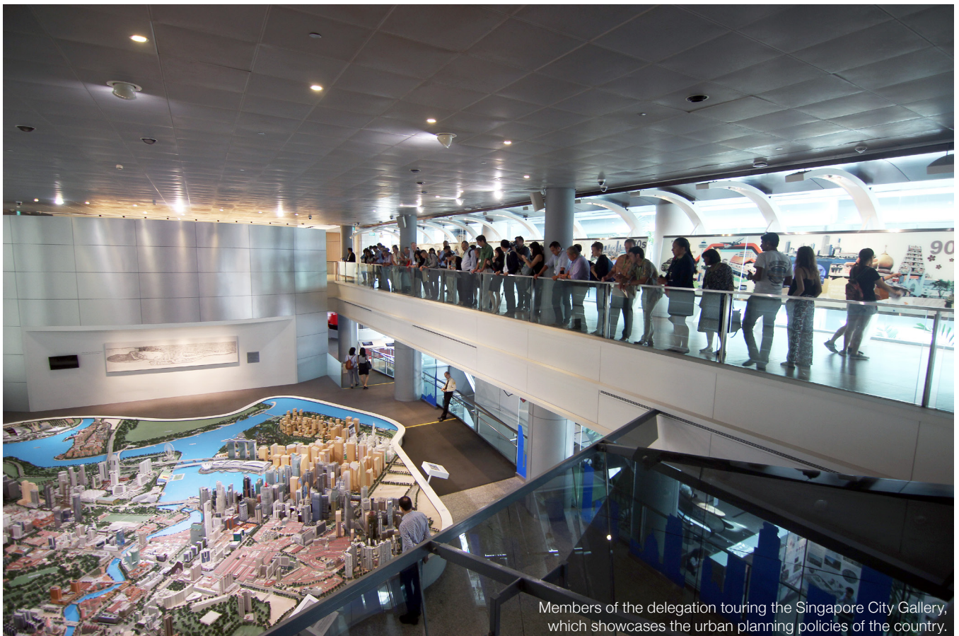
Members of the delegation touring the Singapore City Gallery, which showcases the urban planning policies of the country.