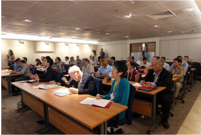
The delegation was briefed by the Housing and Development Board, the authority that develops Singapore's public housing.

also makes its public housing available to everyone, regardless of income. Married couples making under US$8,800 per month can buy a subsidized unit for just US$180,000, regardless of future pay increases. All Singaporean citizens, regardless of income, may buy public housing units in the unregulated secondary market, where prices can reach over $1 million. The