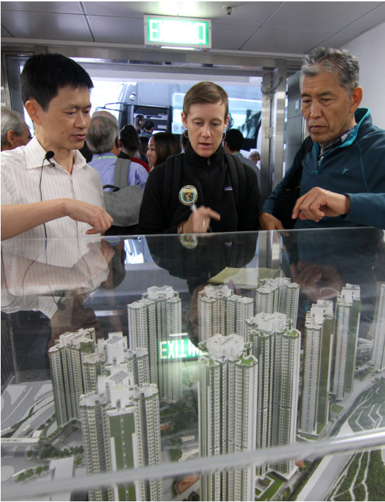
The On Tat Public Housing Estate's 11 towers spread over 16 acres achieve a density of 581 housing units per acre.

condemnation. The Hong Kong government intends to reclaim 4,200 acre, $64 billion manmade islands to house 1.1 million people. Obviously, these are not realistic policies for Hawai'i. But the backbone of the Singaporean housing policy, large scale housing on state land sold for below market prices regardless of buyer income, married to the Hong Kong urban planning policy of providing every necessary service within a short walk, should be adopted to end Hawai'i's housing shortage.