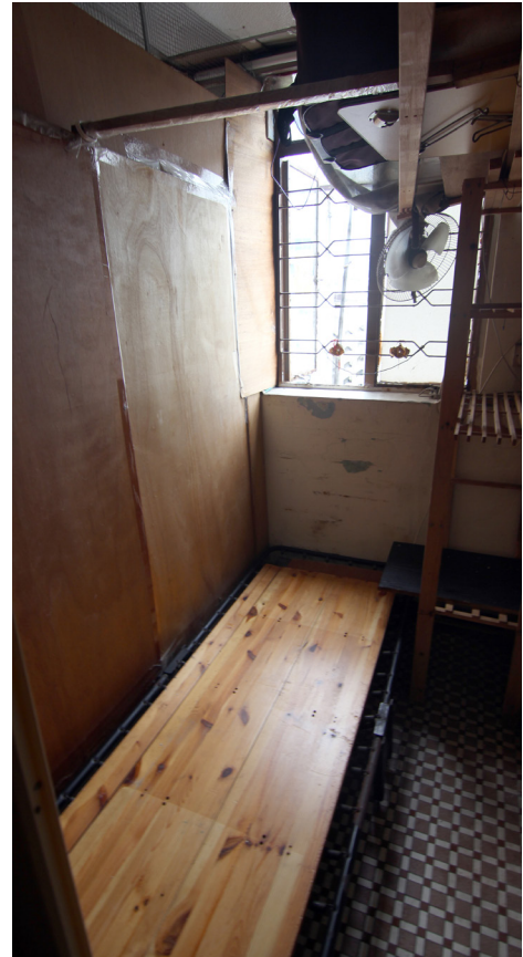
An estimated 200,000 Hong Kongers live in substandard housing, including illegally subdivided homes, cage homes, rooftop homes, and coffin homes.

condemnation. The Hong Kong government intends to reclaim 4,200 acre, $64 billion manmade islands to house 1.1 million people. Obviously, these are not realistic policies for Hawai'i. But the backbone of the Singaporean housing policy, large scale housing on state land sold for below market prices regardless of buyer income, married to the Hong Kong urban planning policy of providing every necessary service within a short walk, should be adopted to end Hawai'i's housing shortage.