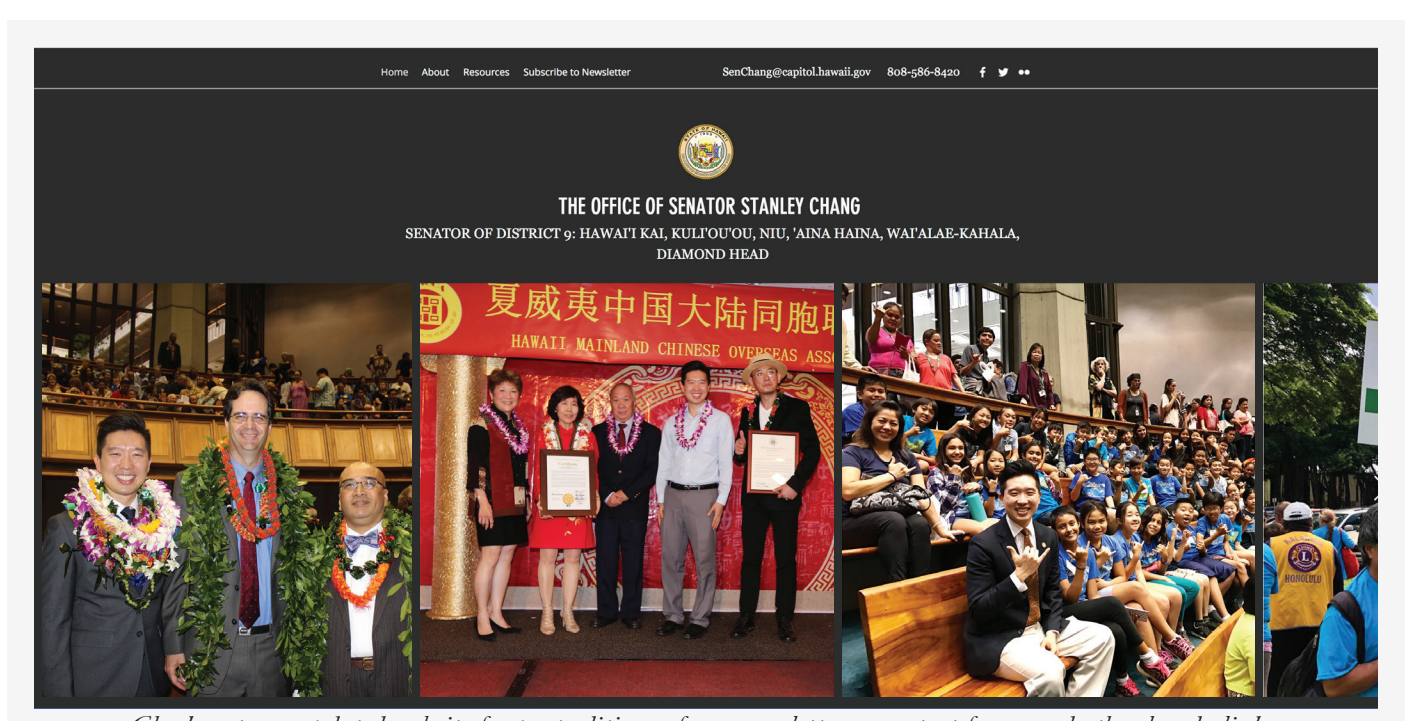
Check out our updated website for past editions of our newsletter, a contact form, and other handy links: