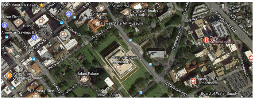
The Hawaii State Capitol is located at 415 S. Beretania Street in downtown Honolulu

If you need further assistance or experience difficulties using the online group scheduling form, please do not hesitate to contact the Office of the Governor directly at 808-586-0221 .