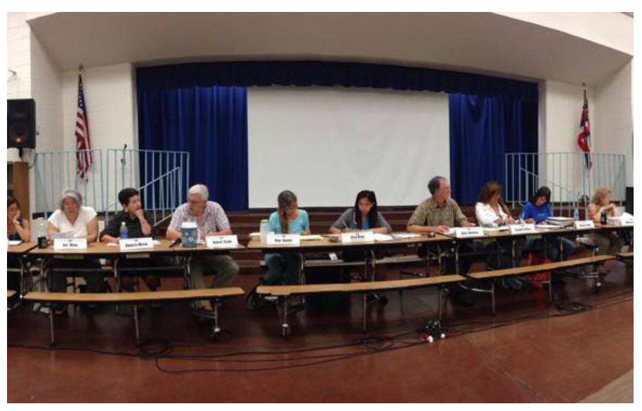
A meeting of the Hawaii Kai Neighborhood Board. Get involved in your Neighborhood Board this year.