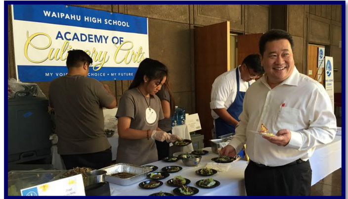
Sampling a dessert during the Hawaii Lodging and Tourism Association Day at the Hawaii State Capitol.