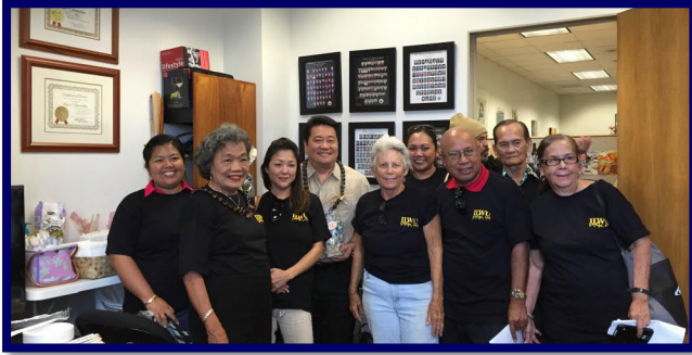
Members of the International Longshore and Warehouse Union (ILWU) stopped by on opening day.