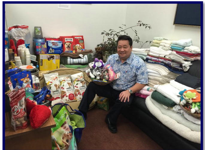
Donations we collected during our recent Pet Project.

Any displaced HC&S workers who have questions on accessing federal relief can contact their local Workforce Development division One -Stop Office at (808) 984-2091.