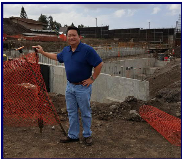
Visiting the King Kekaulike High School Auditorium construction site.

Exempts selected disabled veterans from motor vehicle registration fees and taxes.