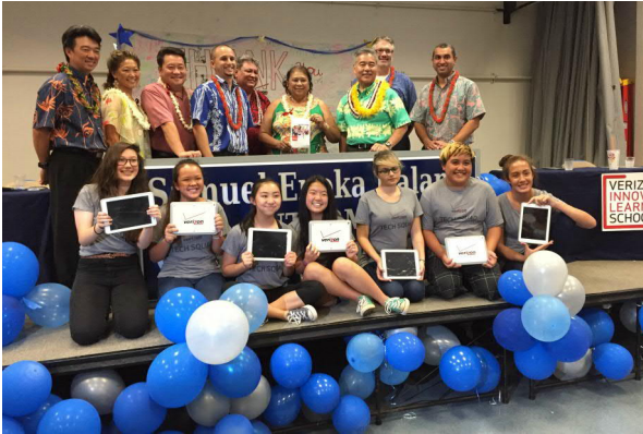
Celebrating Verizon's contributions of tablets to Kalamia Intermediate School.