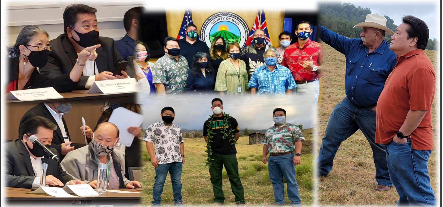
Photo Journal 2021 Legislative Session