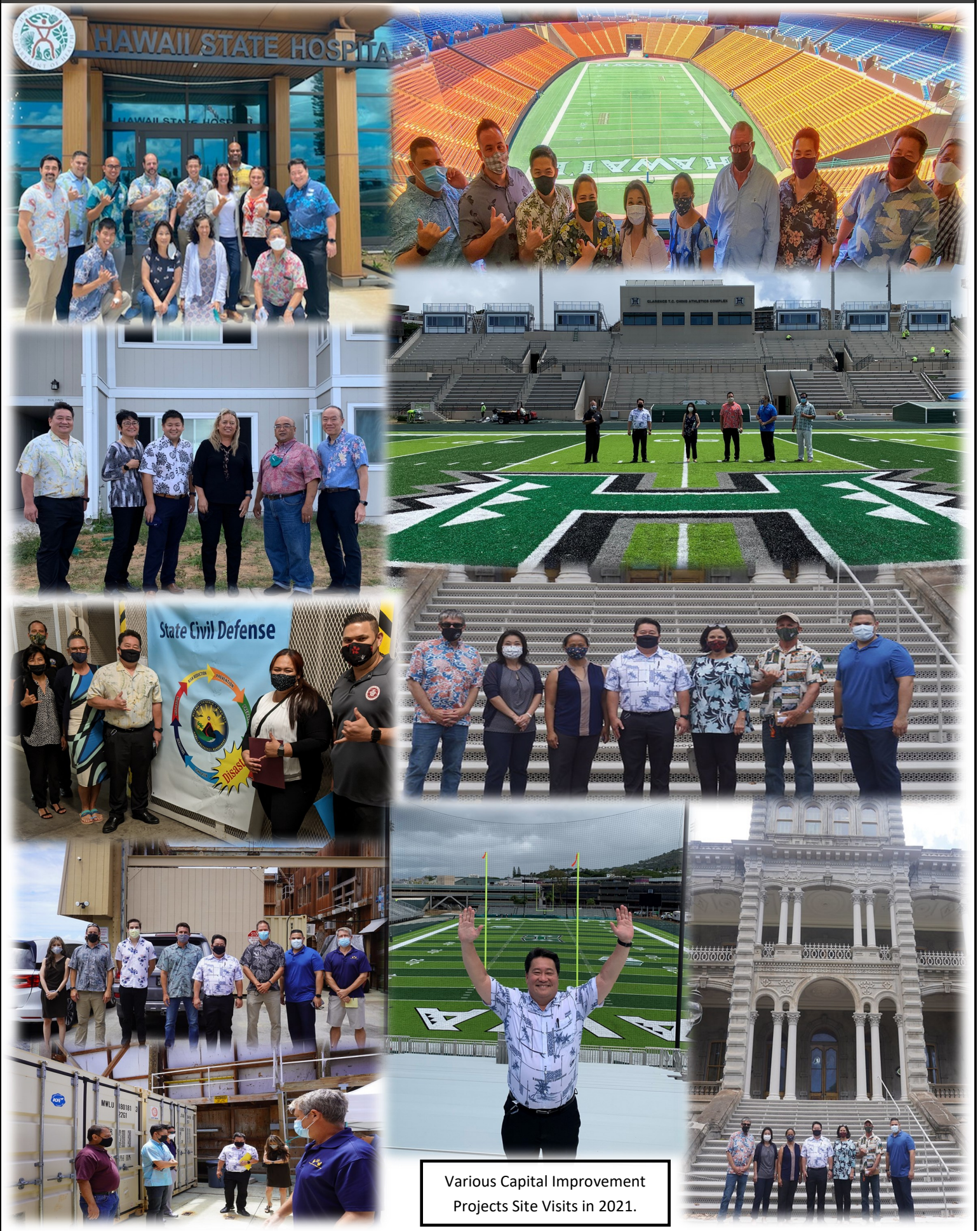
Various Capital Improvement Projects Site Visits in 2021.