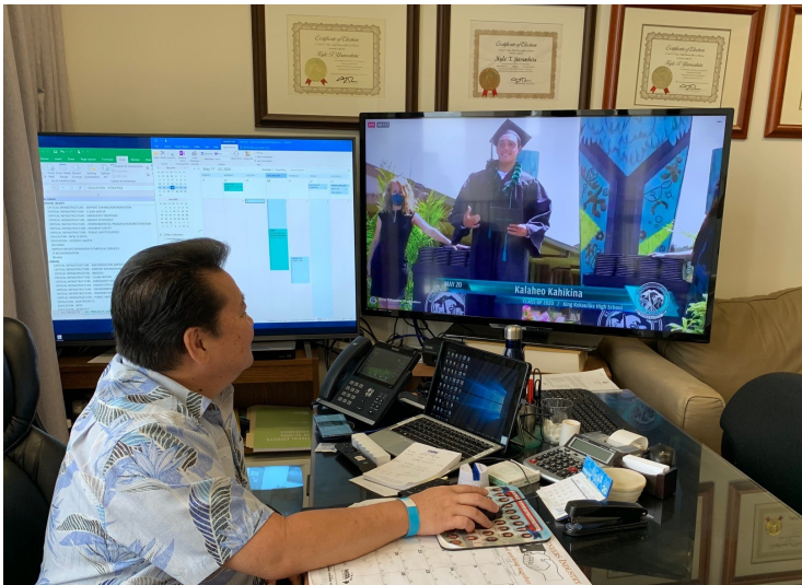
King Kekaulike High School's Class of 2020 Graduation Ceremony Wednesday, May 20, 2020