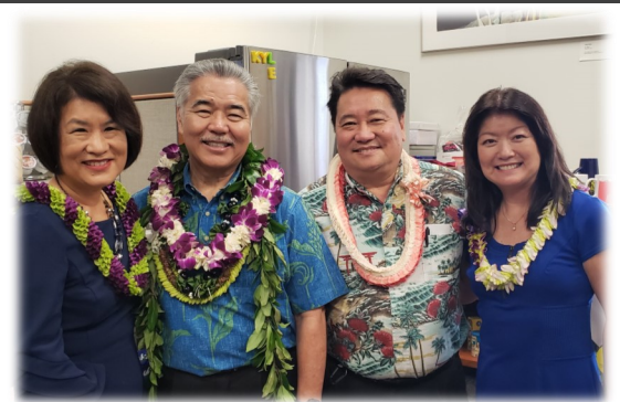
Opening Day with Governor Ige and First Lady.