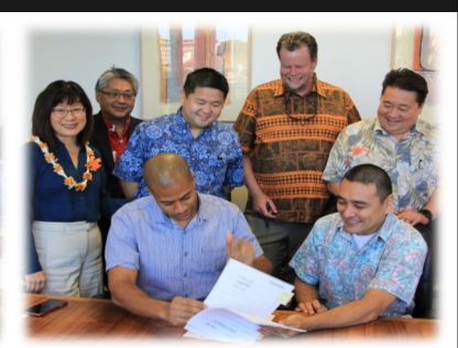
Representatives at the signing of the 2020 House Majority Package.