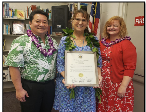
Presenting a certificate to the Makawao Public Library for their 50th anniversary.