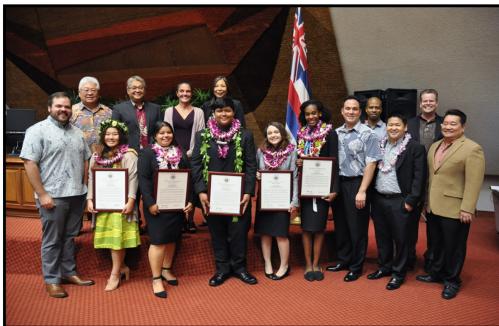
Several Representatives pose with Boys and Girls Club members after they received their awards during floor session.