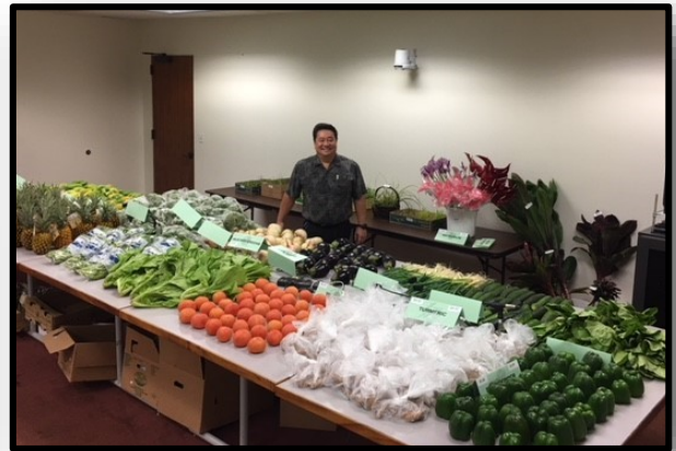
This year's fundraising event Bizarre Bazaar raised over $2,500. All proceeds will go to the Maui Food Bank.