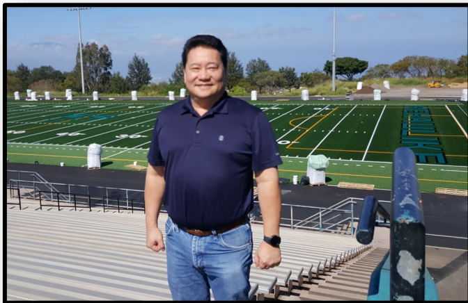
Visiting the new King Kekaulike High School's football field.

Currently, the Department of Education is waiting for a final design. Bidding for the project begins in April 2018. Earmarked for the project is $600,000.