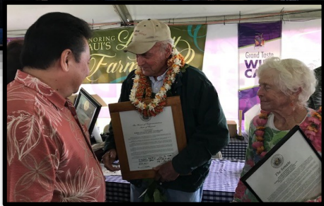
Together with the Legacy Farmers recipients at Maui County Agriculture Festival.