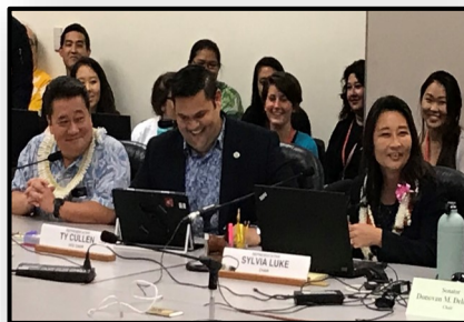
Last day of Conference committee on budget hearing.