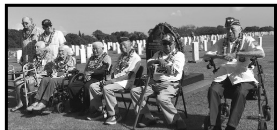
Memorial Day honoring the WWII Veterans at the Maui Veterans Cemetery in Makawao.

Honors veterans and their role in Maui history by renaming Mokulele Highway as Maui Veterans Highway.