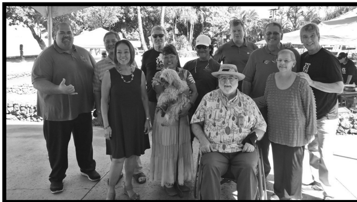
The Maui Economic Opportunity Inc. was chartered on March 22, 1965. It is a private non-profit Community Action Agency.

Supports the early learning of the young children of Hawaii by appropriating $300,000 for each year of fiscal biennium 2017-2019. Allows the Executive Office on Early Learning to enter into contracts with third-party providers for family-child interaction learning programs that support families taking an active role in the social, emotional, and cognitive development of their young children. Transmitted to Governor.