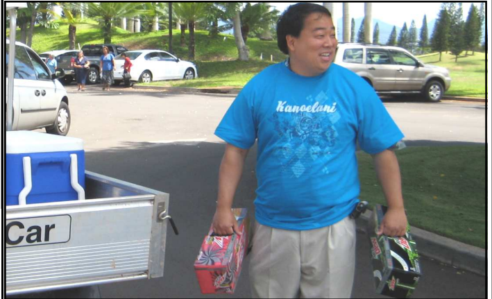
(Above) Volunteering at the putting contest.

It was a very successful event "driving" our keiki to the top, I was very happy to volunteer for the students.