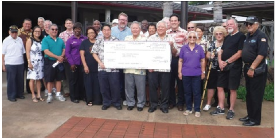
Advocating for our local veterans at the Oahu Veterans Council.