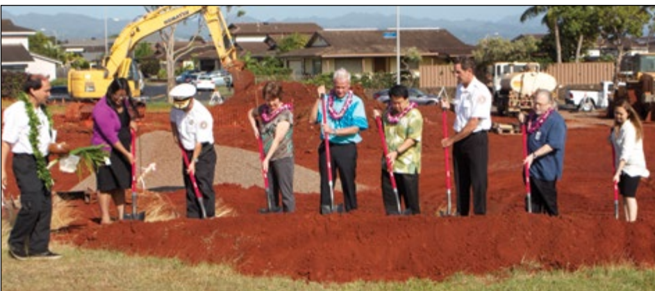
Celebrating the groundbreaking of our community's Central Oahu Ambulance Facility.

Improves public and roadway safety by regulating the use of mopeds, including requiring their registration, safety inspection, and requiring the use of a license plate.