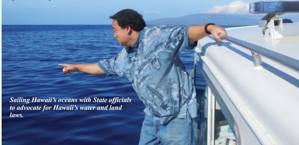
Sailing Hawaii's oceans with State officials to advocate for Hawaii's water and land laws.

Our House Committee on Water and Land worked diligently to preserve Hawaii's unique and scarce natural resources this year to malama our 'aina for future generations to enjoy Hawaii's special beauty.