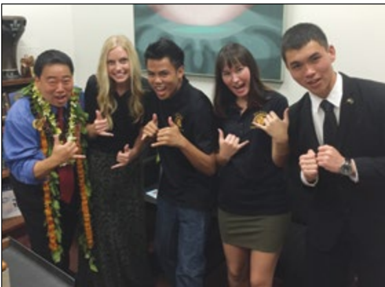
Sharing some "Trojan pride" with the Associated Students of Mililani High School.

Addresses the mental health of homeless persons by funding $500,000 and requiring treatment and care for homeless individuals with serious and persistent mental health challenges to enable them to reside in a permanent dwelling unit or homeless facility.