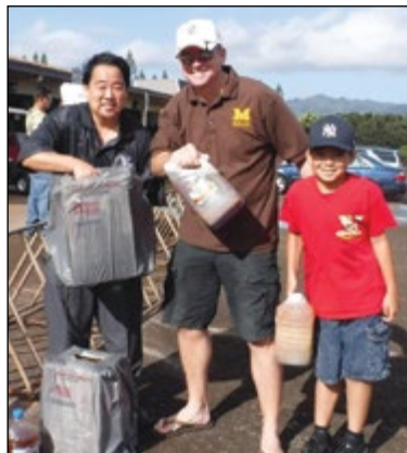
Cleaning up our community at Mililani Waena Elementary School.