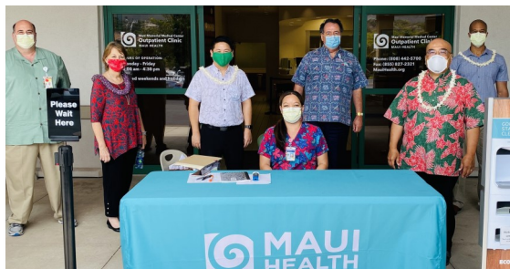
LEFT: Some of the Maui Delegation and myself during a site visit at MMMC

The Maui Delegation is collectively engaged with the Maui Memorial Medical Center (MMMC). The Maui Delegation is aware of the concerns from the community, and we are in direct communication with MMMC to ensure those concerns are vetted and addressed.