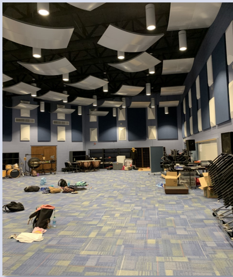
ABOVE: The newly-completed band room at Maui High School.