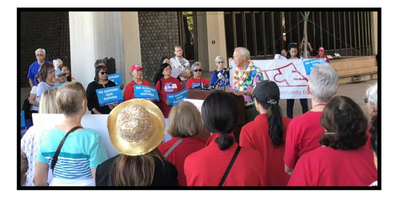
▲ Rep. Takayama spoke at a Kupuna Caregivers rally Feb. 7 at the Capitol sponsored by community groups supporting legislative measures to assist family caregivers.