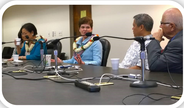
Meeting with the United States Department of Agriculture, Deputy Secretary Krysta Harden .