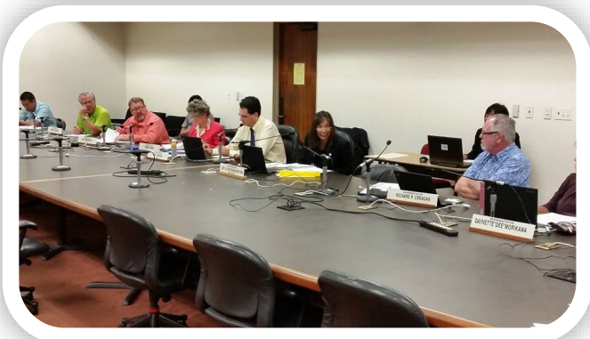
Chairing the Judiciary Hearing on resolutions; including a resolution on how banks will handle medical marijuana dispensaries.