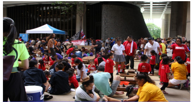
Onto the displays outside surrounded with live music and attractions to the public