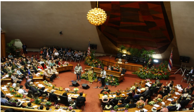
Starting off with a live performance within the House Chamber:

January 16th: Opening Day when the 2019 Session filled with lively energy with many people performing, visiting the Hawaii State Capitol offices of senators and Representatives. To be a part of this special day has shown and reminded me of the duties as a representative to the constituents I serve.