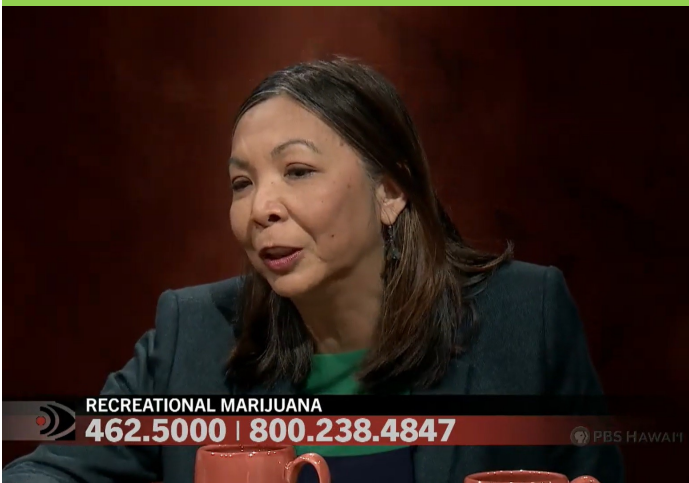
On PBS Insights discussing decriminalization of Cannabis.

With every new year, there are new events that happen that I am grateful to have been a part of and witness throughout this past month of January. These past events in January remind me of my duty to the constituents I serve and the reason as to why I became a representative in the first place. As the 2019 legislative session continues forward, there will be many more events that I will attend to ensure as the representative of Puna.