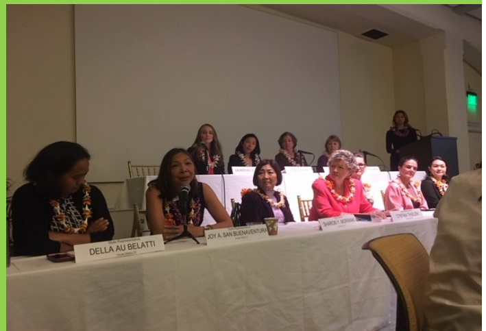
WLC (Women’s Legislative Caucus) Meeting

https://www.pbshawaii.org/insights-on-pbs-hawaii-recreational-marijuana/