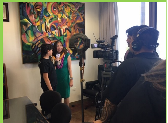
Olelo Opening Day 2019 Interview.

To view this episode tune in on Feb. 12th 8:30am, Hawaiian Telcom Channel 1049 or visit: