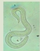
L3 stage A. cantonensis ~0.5 x 0.03 mm