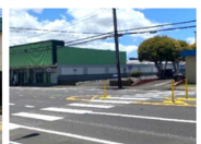
California Avenue Crosswalk with Pedestrian Refuge Island