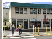
North King Street Crosswalk with Pedestrian Refuge Island