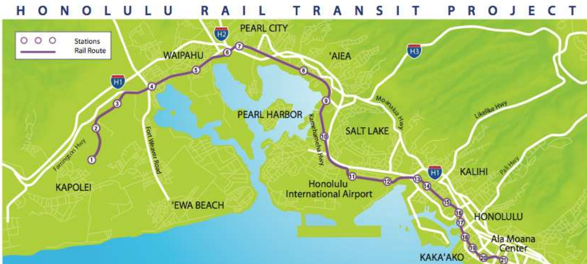
Map of the proposed rail transit routes

She encouraged the students to stay informed and involved in the political process so they can have an impact on issues that are important to them.