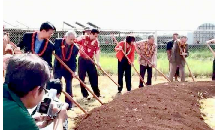
Local, State and Federal officials at the rail project groundbreaking ceremony

It is estimated that the project will not be completed until the year 2030 and will cost over $5.5 billion.