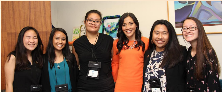
Top - I had the opportunity to meet with student government leaders from Mililani High School on January 24, 2020. The students were participating in the annual Secondary Student Conference at the State Capitol. Go Trojans!