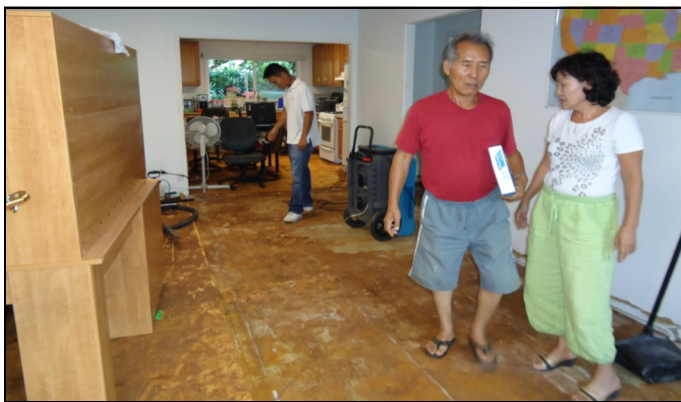
A water main break on Kilauea near 9th Avenue flooded the Kwak Family home