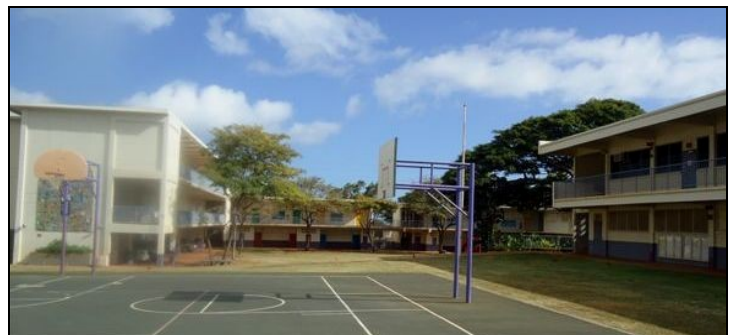
Education officials are intent on using Lili'uokalani School for DOE offices.