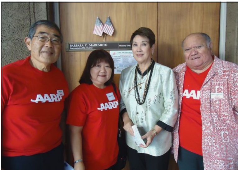
A delegation from AARP visited the Capitol with information regarding a legislative wish list. Among many requests, members asked for increased funding for Kokua Care, HB2196, and no income tax on pensions.

HB2165 - Lowers the state motor vehicle registration fee by $10.