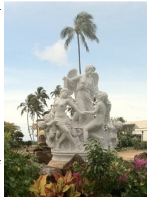
No Hawaiian sense-of-place

Though not a big problem in Kahala, the nuisance bills would also include "abandoned, wrecked, or dismantled motor vehicles or boats; automotive parts and equipment, appliances and furniture; containers, packing materials, scrap metal, wood, building materials, concrete masonry, litter, garbage, junk, rubbish, and debris; sand, gravel or concrete on property; standing or stagnant water allowing vermin and insects to breed; attracting and providing a place of temporary abode to vagrants, interlopers, or trespassers."