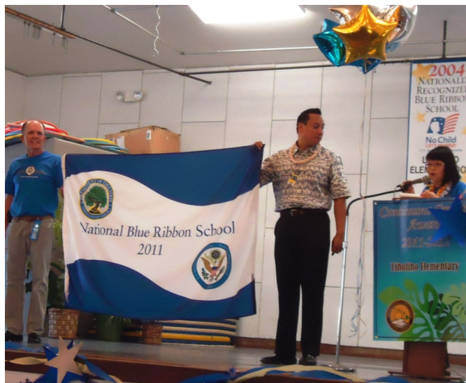
Liholiho was designated again as a No Child Left Behind Blue Ribbon School.

DINE AT KCC KA IKENA Kapiolani Community College 1/24 – 2/22 3/20- 4/27 Lunch 11:00, 11:30, 12 Noon Dinner 5:30 – 5:45 pm Reservations 734-9499 Reservations unnecessary for 220 Grille – 11-12:45 pm