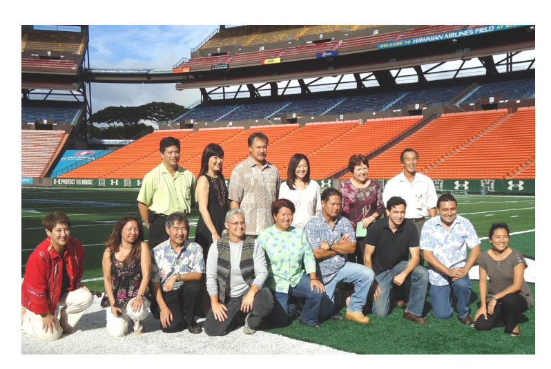
Stadium staff briefed legislators on recent safety and structural improvements.

See the new exhibit at <u>Bishop Museum</u>, <u>Tradition</u> & <u>Transition</u>, featuring stories of Hawaii Immigrants. The first phase features documents and artifacts of Japanese immigrants collected by the non-profit <u>Hawaii Imin Preservation Society</u> (Shiryo Hozon Kai) and housed for safekeeping at Bishop Museum since the onset of World War II. Rep. Marumoto serves on the board of the society. Again at Bishop Museum, a reception hosted by the <u>US – Japan Council and the APEC Host Committee</u>. On hand were <u>Sen. Dan Inouye</u>, the <u>Japanese Premier and Foreign Minister</u>, the <u>US Secretary of Commerce John Bryson</u> and many other dignitaries. Secretary Bryson said that he spent a year at <u>Kaimuki Middle School</u> many years ago. The <u>100th Infantry Battalion Veterans</u> dedicated an educational display at the <u>44nd RCT Clubhouse</u>.