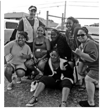
Mahalo Aloha Aina volunteers!