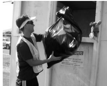
Turning 'trash into cash' at this year's Aloha Aina Day by recycling waste and no longer needed household items to benefit Farrington High School Athletics