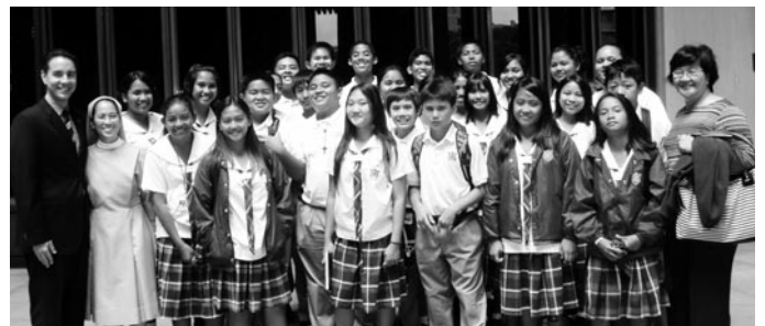
St. Anthony's Day at the Capitol.

2nd Annual Taste of Kalihi! FOOD! FUN! ENTERTAINMENT! September 6, 2008 • 10:00 am-8:00pm Colburn Street between McNeil Street and Waikamilo Road See You There!