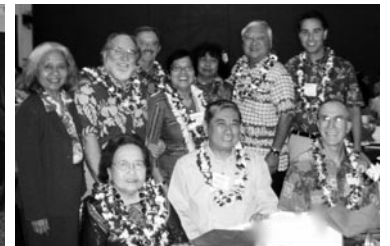
First Annual Global Language Conference at the UH.