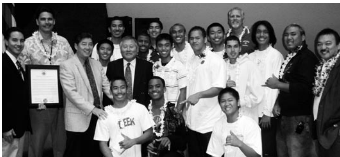
Congratulations to the Farrington High School Men's Varsity Basketball our State Champions!