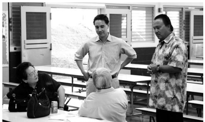
Discussing the issues at Lawmakets Listen.