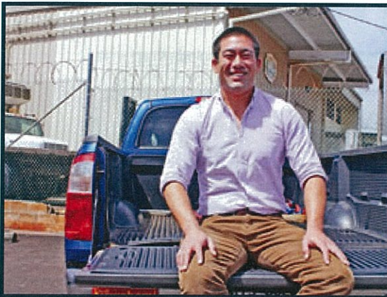
Midweek Kauai April 2011

Included in the cuts are labor savings of $88.2 million in each year of the biennium due to state workers taking a 5% pay cut. In addition, the legislature passed HB575 Extension of salary cuts which extended a 5% pay cut for state legislators, judges, the governor, lieutenant governor, and department heads and deputies.