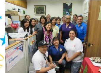
Members of ILWU Local 142