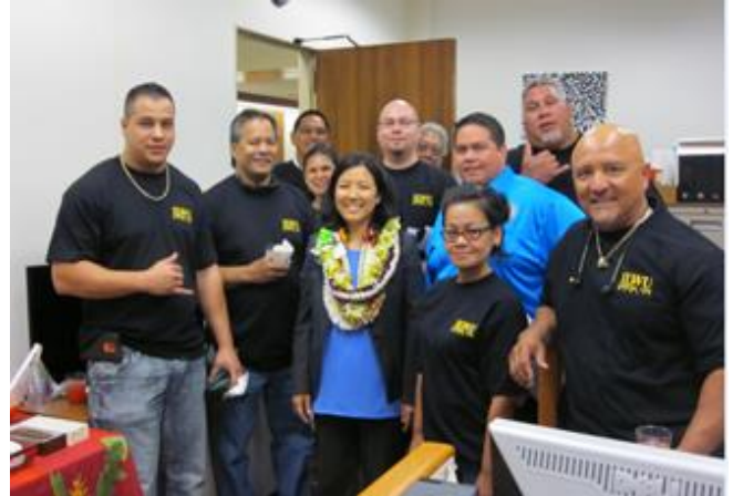
Rep. Ichiyama visits with members from ILWU Local 142 on Opening Day.