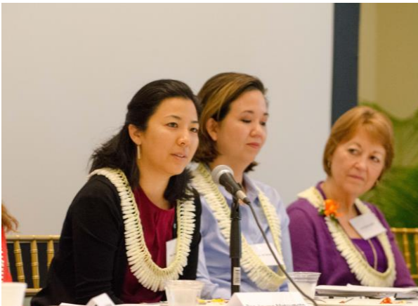
Rep. Ichiyama participates in the panel discussion at the 2016 Hawaii Women's Legislative Caucus Breakfast.