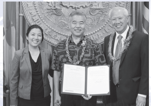
Rep. Ichiyama and Rep. Takayama attended Governor Ige's bill signing of SB 3126, which appropriated funding for air conditioning and heat abatement projects for our public schools.