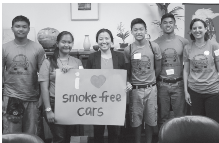
Rep. Ichiyama met with local high school students regarding a bill to prohibit smoking in cars with a minor present.

HB1050 SD2 CD1 Mandates the Department of Agriculture to perform specified tasks to address the interisland spread of invasive species.