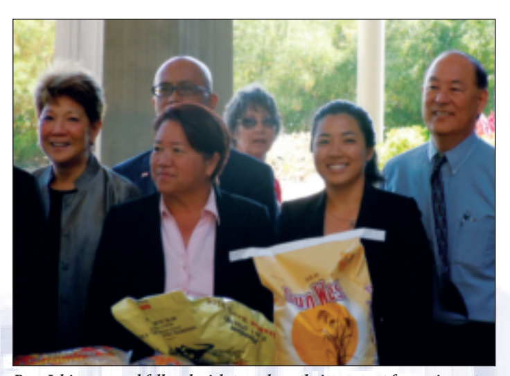
Rep. Ichiyama and fellow legislators show their support for seniors at the Kupuna Rally at the State Capitol.