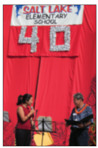
Congratulations to Salt Lake Elementary School on their 40<sup>th</sup> Anniversary!

In order to protect Kamananui Valley, the last remaining undeveloped ahupua'a in urban Honolulu, HCR172 requests the Department of Land and Natural Resources to work with the Moanalua Gardens Foundation to develop a Memorandum of Understanding and to provide a progress report to the Legislature prior to its next session in 2012