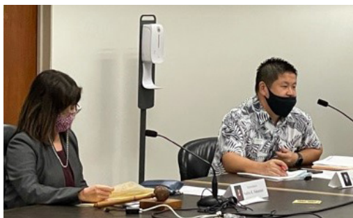
Negotiating in Conference Committee with the Senate on various House Bills with Rep. Nadine Nakamura.