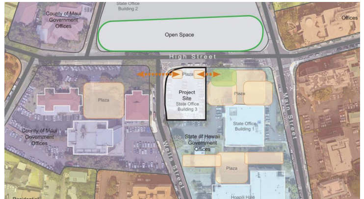
Wailuku State Office Building 3 at the "Old Wailuku Post Office" site.

http://dbedt.hawaii.gov/hhfdc/kahului-civic-center-and-wailuku-state-office-bldg-3/