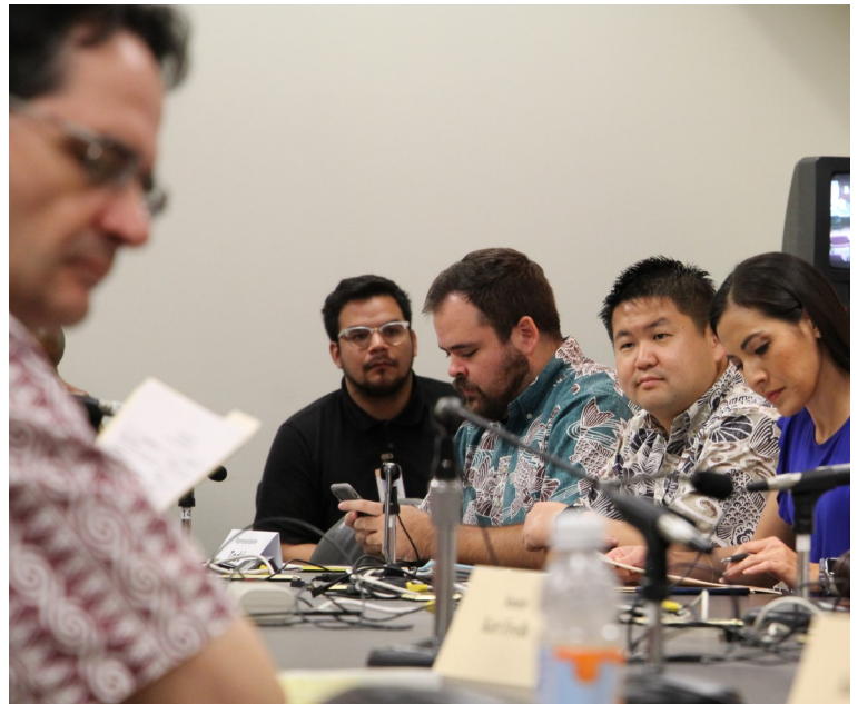
Troy in a Conference Committee hearing with the Senate, voting to approve the final draft of a bill before it moves on to Final Reading.