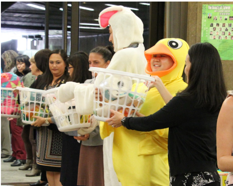
Troy in an "Easter chick" costume with Rep. Scot Matayoshi in an Easter bunny costume, helping the Women's Legislative Caucus with its annual Easter Basket Drive to help families transitioning into permanent homes.

Appropriates $5,102,000 for the immediate and long-term rehabilitation of Maui Community Correctional Center, and exempts projects funded by the appropriation from the procurement code. Appropriates $2,000,000 to temporarily house 248 inmates at a different facility while the upgrades are being made, and to transport them back to Hawai'i.