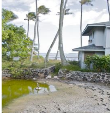
Left-Kalauha'ihā'i Fishpond, 1980's