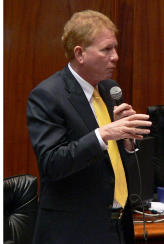
Rep. Fontaine Speaking on the Statehouse Floor

Watch the “Fontaine Factor” Akaku2 Channel 53 Wednesdays 8:00pm