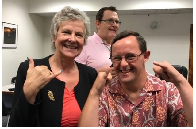
ARC of Kona visiting the Hawai'i State Legislature.