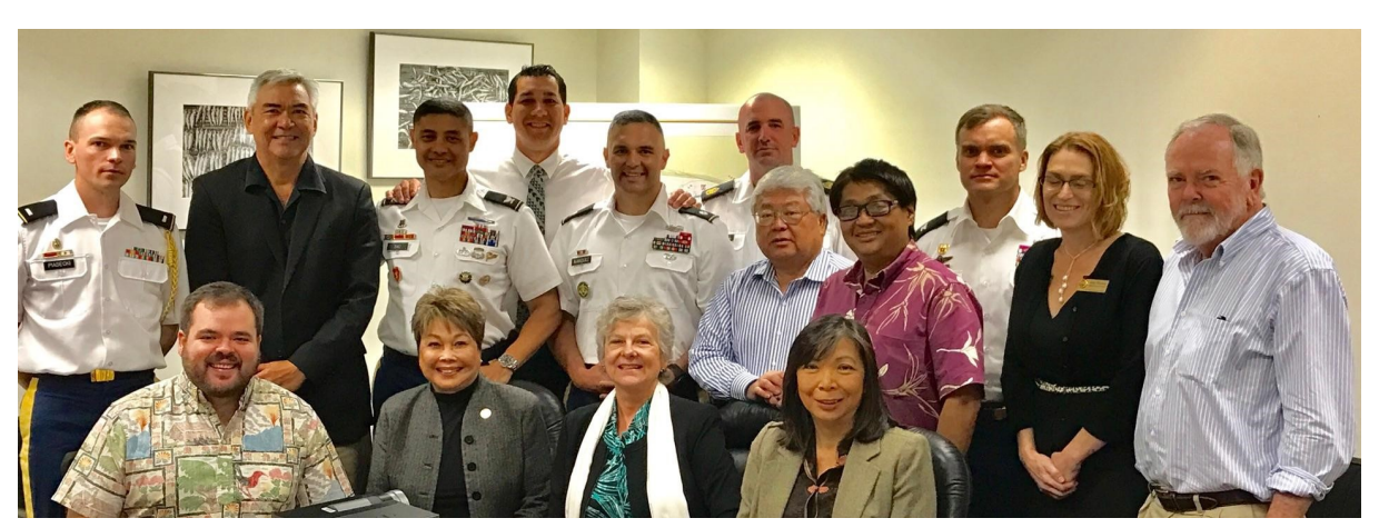
Pohakuloa Training Command visiting and briefing the Hawai'i Island Legislators.