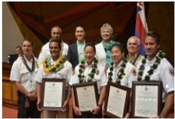
The Legislature recognizes all county Ocean Safety Divisions and Ocean Safety Officers.