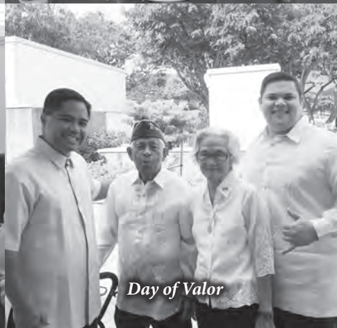
Day of Valor