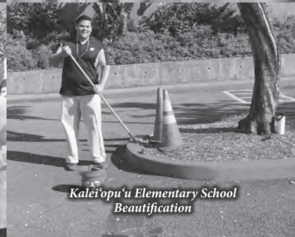
Kalei'opu'u Elementary School Beautification