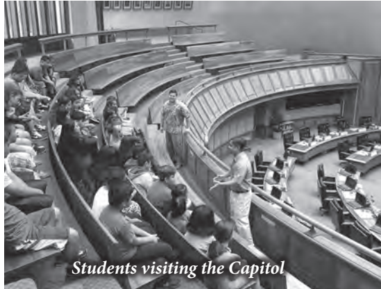
Students visiting the Capitol