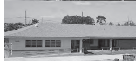
New Building at Ewa Elementary