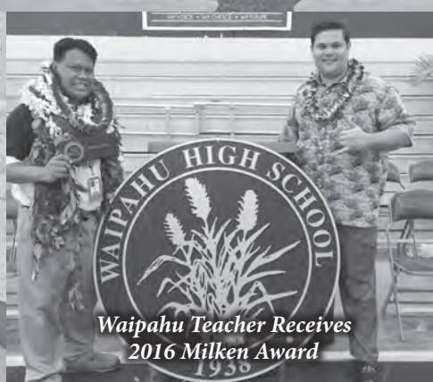
Waipahu Teacher Receives 2016 Milken Award