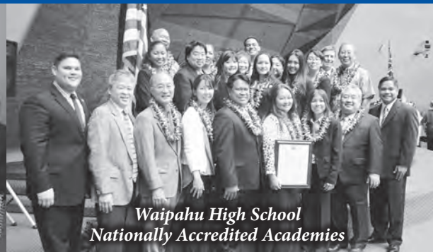
Waipahu High School Nationally Accredited Academies