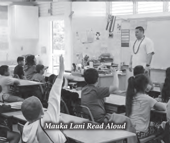
Mauka Lani Read Aloud