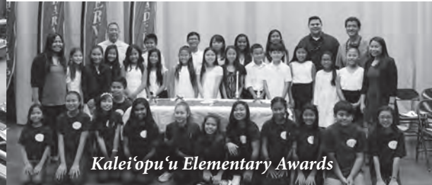
Kalei'opu'u Elementary Awards