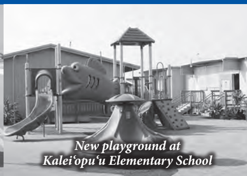
New playground at Kalei'opu'u Elementary School