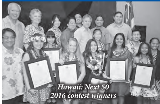
Hawaii: Next 50 2016 contest winners