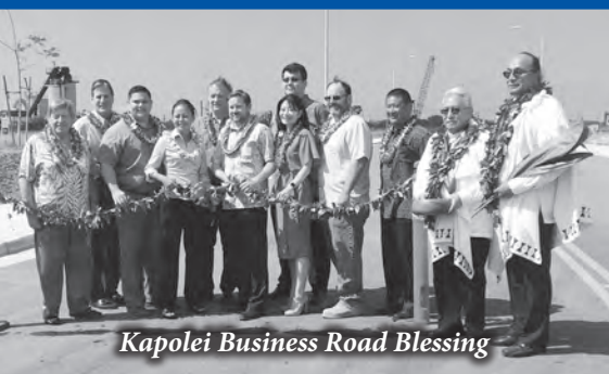
Kapolei Business Road Blessing