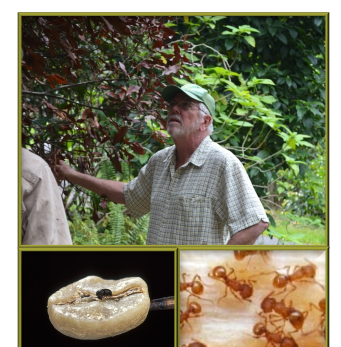
Top: Inspecting damage from the macadamia felted coccid on trees in Ka'u. Bottom left: Adult Coffee Berry Borer on a green coffee bean. Bottom right: Funds allocated to HISC will fight many invasive species such as the Little Fire Ant. Rep. recently worked with the Dept. of Agriculture and The Nature Conservancy in order to address a Little Fire Ant outbreak at the County Park in Na'alehu.

A number of bills were introduced this session that, if approved, would have required the labeling of foods containing genetically modified content. A hotly debated issue, these bills were eventually deferred (killed). Much of the discussion centered around the conflict between the "Right to Know" and the "Precautionary Principle," which has been endorsed by many nations, including the entire European Union, against the possible increased cost of labeled food. Some argued that even if labeling was