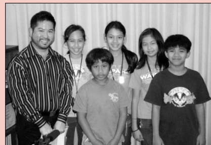
Middle school students interviewing me about the 2010 legislative session.