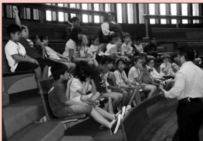
Webling Elementary School visit

Mahalo to all the students and their teachers for visiting me at my capitol office this past year. I enjoyed explaining the legislative process and answering all the good questions about our state government!