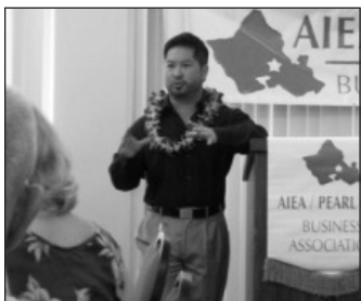
Meeting with the APCBA to discuss economic challenges facing our state and the legislative process in general.

The old Kam Drive-In site, currently home of the Kam swap meet, is being considered for redevelopment by the Robertson Properties Group (Los Angeles, CA). The proposed project will include residential and commercial components. My office will continue to keep surrounding residents apprised of the project as information becomes available. Consider reviewing minutes from the May 10 Aiea Neighborhood Board meeting when the developer heard concerns from our community.