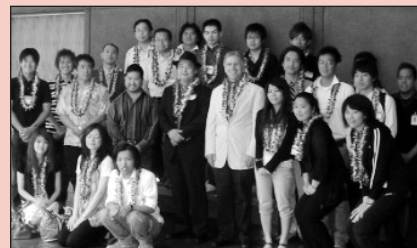
Students from the University of the Ryukyus visiting me at the capitol to discuss issues before the Legislature.