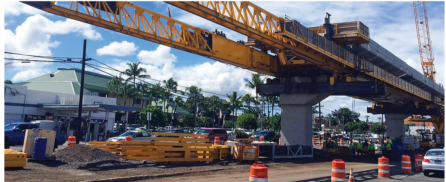
FARRINGTON HIGHWAY between MOKUOLA and AWAMOKU STREETS Estimated Start Date: February 29, 2016 Estimated Duration: 7 to 8 Weeks